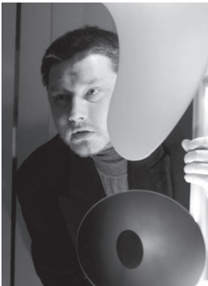
Indrek Hargla

Hargla's next novel in a similar vein, Pharmacist Melchior and the Ghost of the Wheel Well , which deals with solving murders in medieval Tallinn, is more complicated and multilayered. The book is again set in the Tallinn of the early 14th century but, in this case, the author has here and there dropped some intertextual hints which will amuse readers who recognise them, relating the local cultural space to a wider European context. The mood of ... the Ghost of the Wheel Well is heavier than in the first Melchior novel. A mysterious ghost appears, and those who see it soon die. The different characters are enjoyable and, although the intrigue is not very smooth, the end ties everything skilfully together.