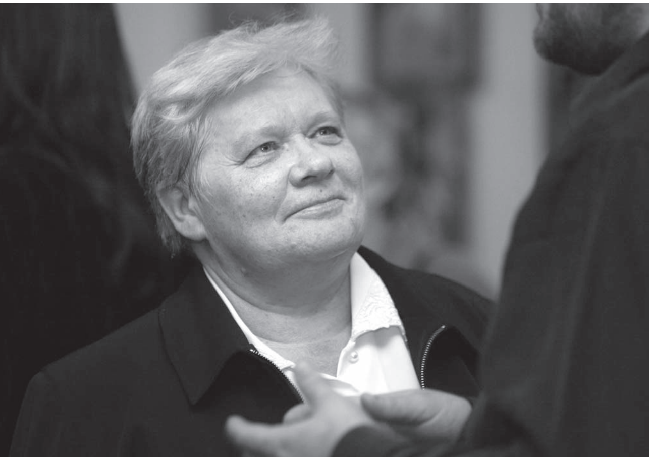
Ene Mihkelson