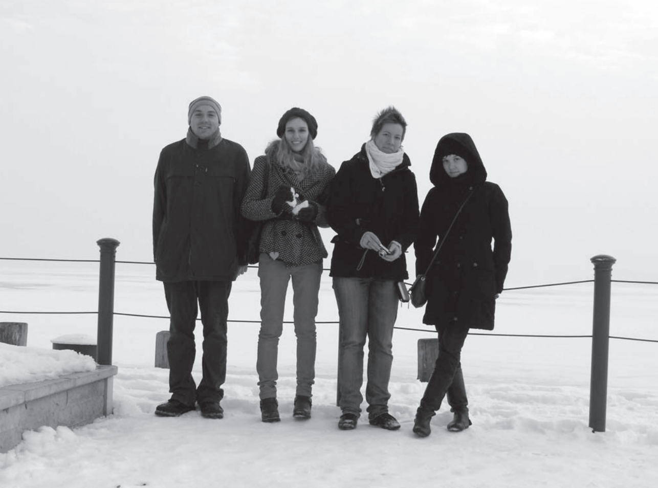
Translators at Lake Balaton

a mixed reception. The novel's experimental character and its turn towards non-traditional canons of the novel is also a significant aim of the magazine. Prae often tackles peripheral genres (for example science fiction, horror literature and cyber punk) and non-typical topics.