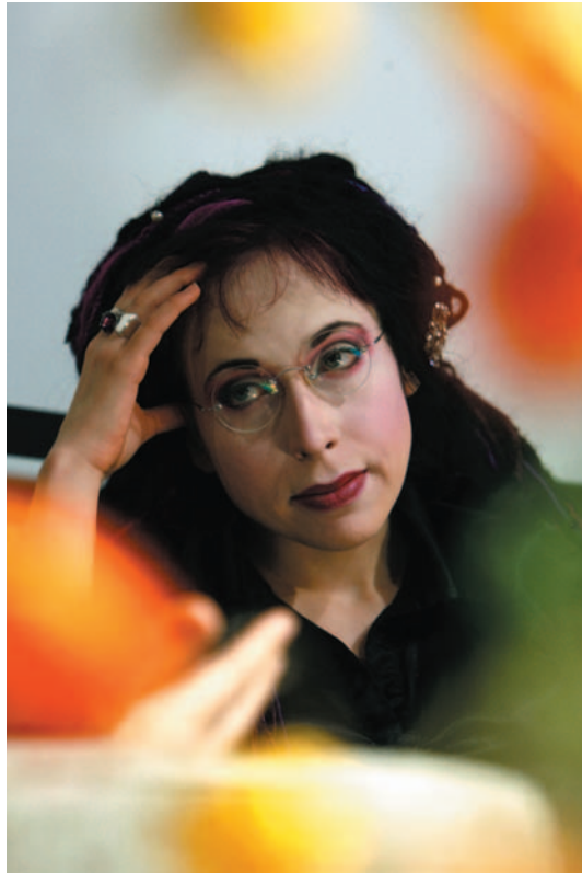
S o f i O k s a n e n